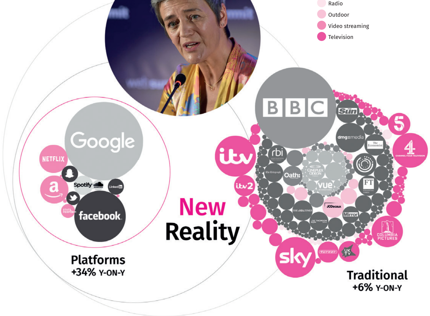
© Whitereport data & montage. Bubbles represent the latest reported or estimated real annual UK revenues by companies. Visualisation: Flourish & Whitereport.